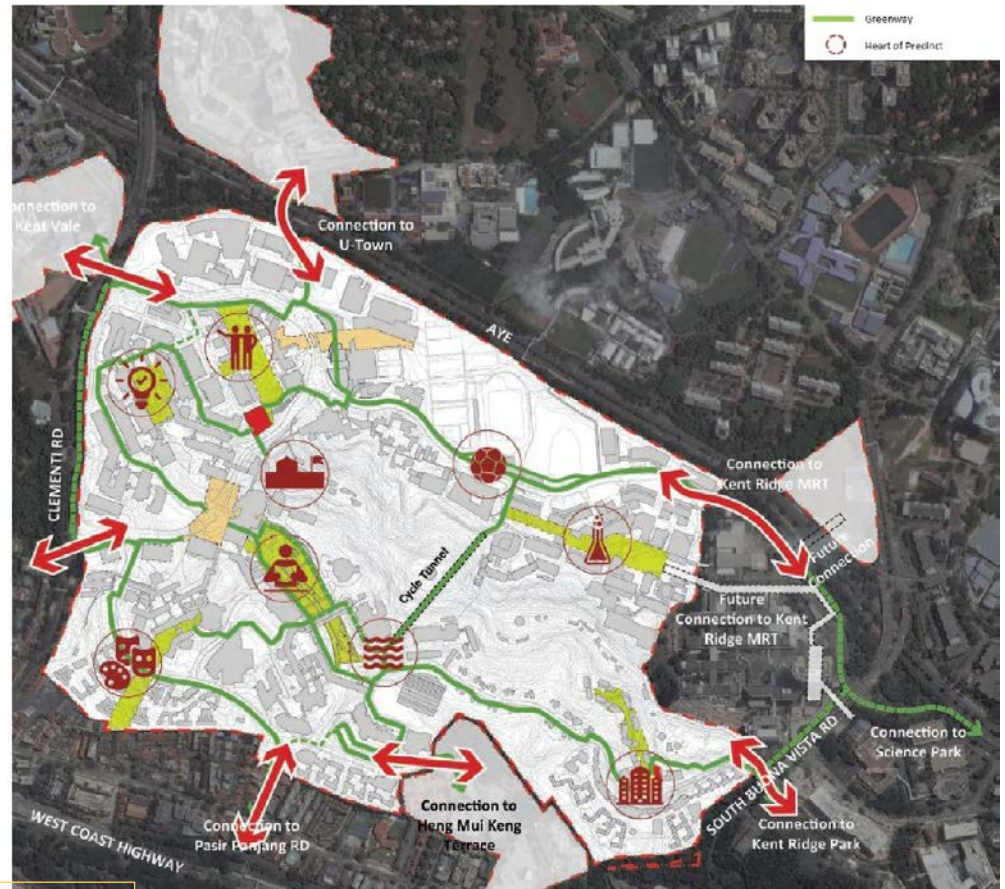
Proposed Greenway conceptual plan

Network of covered linkways /walkways for pedestrian; cycling/personal mobility devices and internal shuttle bus system connecting the campus towards a car-lite & pedestrian friendly environment.